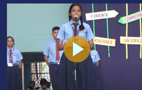
Special assembly EK BHARAT SHRESHTHBHARAT ON JAMMU & KASHMIR