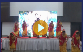
AD-MAD (Mera Product Mera Funda)