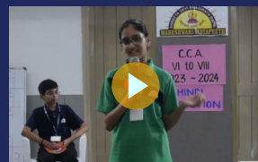
Hindi Elocution Activity (Grade VI-VIII)