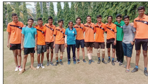
Interschool Kabadi Competition (Boys under 19 category was conducted by SGFI. MVP team secured 3rd position)

Exceptional performance in Yoga in the 18th District Yoga Championship and has been selected for Nationals organised by the Radiant International School