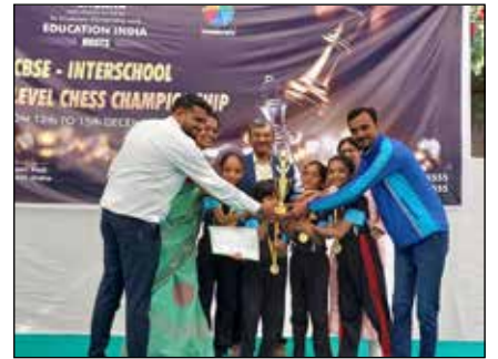
Girls (Under -11 category ) 1 st position (selected for Nationals.) Girls under -17 category- 3 rd position