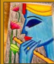
DIKSHA CHANDAK V - C