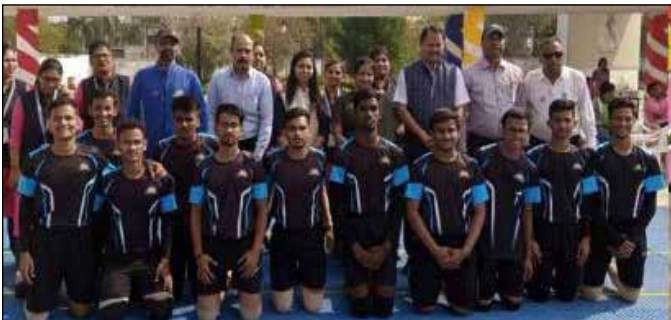
Boys (Under -19 category) - 3 rd position