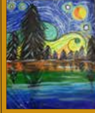
VINAYAK GOVEL VI - D