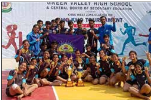
Boys (Under-19 category)-Runners Up Girls (Under-19 category) Champion (selected for Nationals)