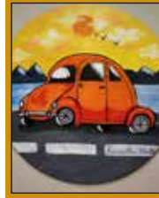
KANEESHKA BHATTER IV - A