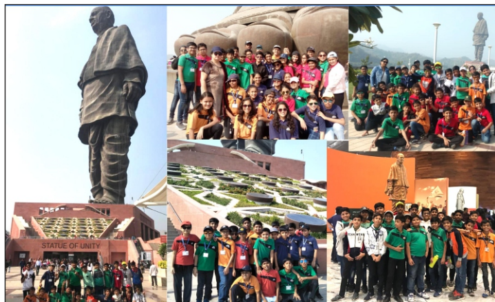
STATUE OF UNITY (CLASS 5 TO 8)