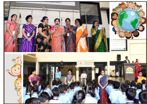
Children's Day Celebration 14th November, 2019

Constitution day was celebrated on 26th November, 2019 in the auditorium. Students of class VI to VIII watched a video regarding making of constitution and also read the preamble which is the spirit of the constitution.