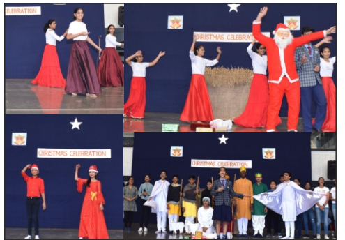
Christmas Celebration 26th December, 2019