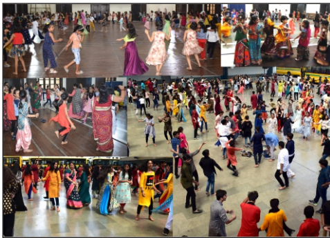
Navratri Celebration 23rd October, 2019