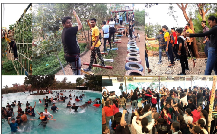
DEV'S CAMP (CLASS 9 TO 12)