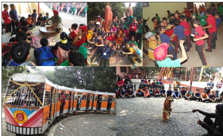
DHOLA RI DHANI (CLASS 1 TO 4)