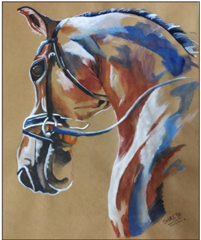
Shreya Shah 10 A