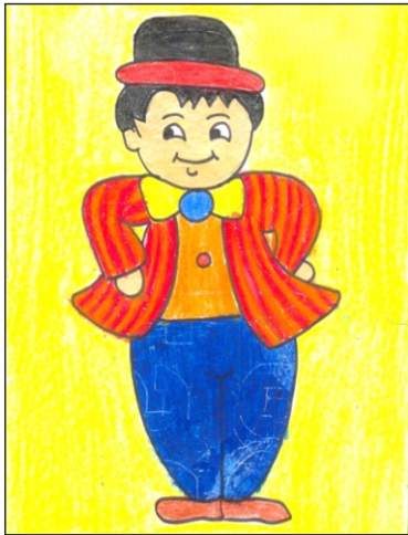
Vedant Anand 3 B