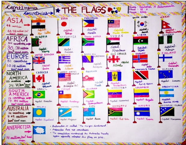
Devansh Palsanawala 4 A